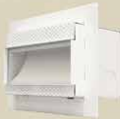
LS Series Trimless

Floor Wash and Night Lighting safely lights your way. Shallow AK, HITW, Mini and the new miniature, LS Series can recess into a standard wall (even with 1 hour fire rating!)