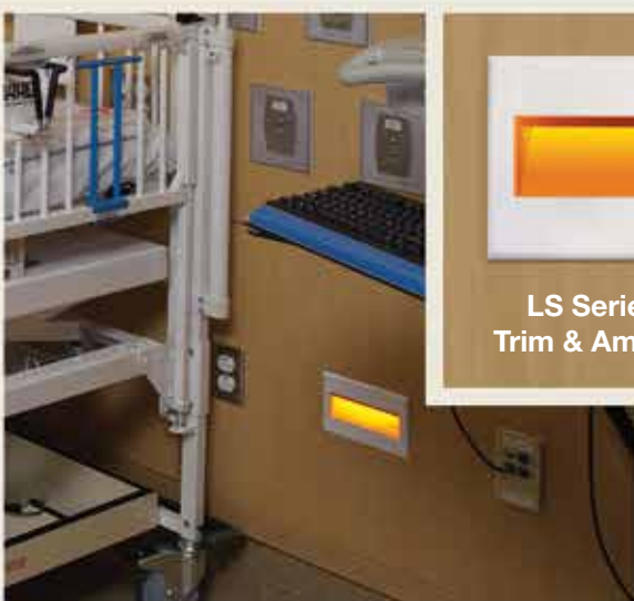
LS Series with Trim & Amber Lens