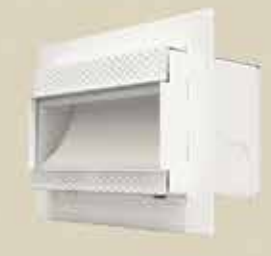
LS Series Trimless

Shallow AK, HITW, Mini and the new miniature, LS Series can recess into a standard wall (even with 1 hour fire rating!)